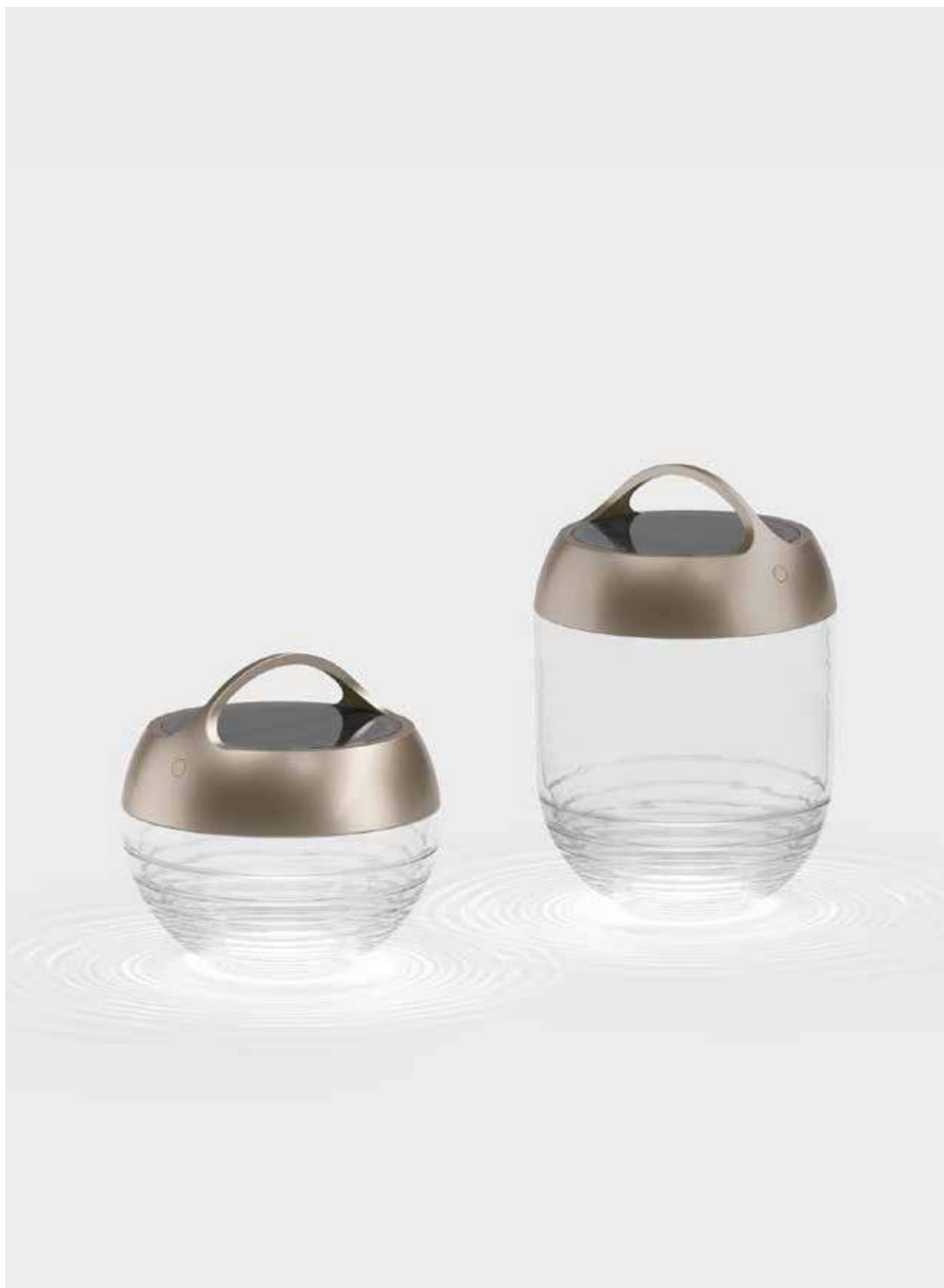
aqu Design: Klaus Nolting