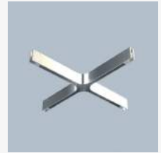
Cross joint Hush