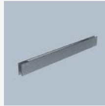
Linear joint Hush