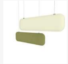
Single sound absorbing panel Hush