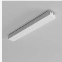
Ceiling rose with power supply 300W Hush