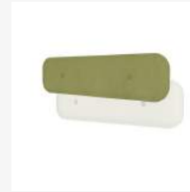
Sound absorbing panel Hush lamp body