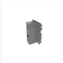
Middle head Hush