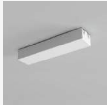
Ceiling rose with power supply 75W Hush