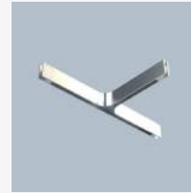
T joint Hush