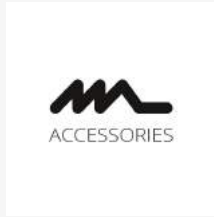
Angle joint L90° Hush