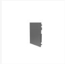
Terminal head Hush